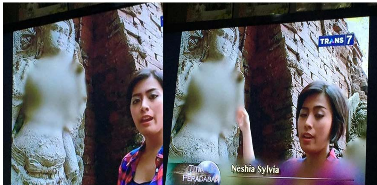
Fig 3. Screen capture of TV censorship on Hindu statue, 2016.

Today, web blocking continues to trouble Indonesian activists and netizens alike. Try to access pop culture touchstones like Vimeo, Tumblr or Reddit and you’ll be greeted with a government block-page. In January 2018, a new filtering system was launched which crawls the web and issues alerts whenever “negative” or “pornographic” material is found (Davies, 2018). Casting with such a crude net means that these activities are especially harmful to fragile communities who depend on the Internet as an alternative space for self-actualization. Indeed, this system is routinely utilised in the censorship of gay and lesbian content on the Indonesian Web (Widianto, 2016).